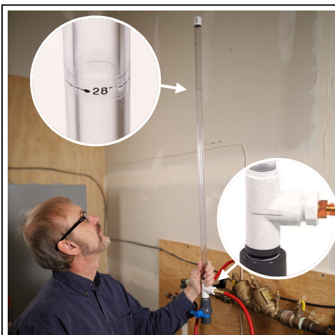
Figure 2: Observing water level in Site Tube during test while holding at correct height