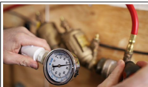
Figure 4: Testing static line pressure