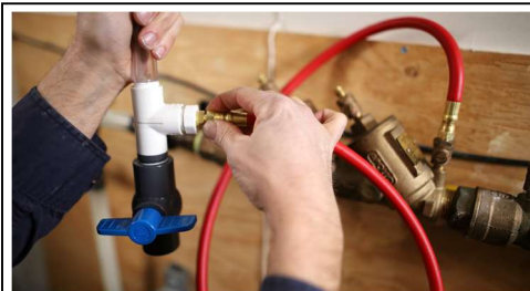
Figure 1: Connect Site Tube to Test Cock

The SamsonRiser Backflow Test Site Tube is designed to be a low maintenance and robust tool that will not be damaged by sand or sediment, and will not cloud overtime. If water spots or mineral deposits develop, the assembly may be washed with a non-abrasive detergent or vinegar solution and wiped down with a soft cotton or microfiber cloth.