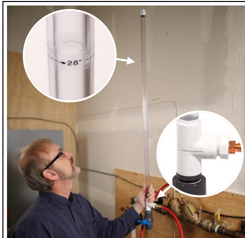
Figure 2: Observe water level in Sight Tube during test while holding at correct height