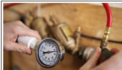
Figure 4: Test static line pressure