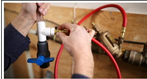
Figure 1: Connect Sight Tube to Test Cock

The SamsonRiser Backflow Test Sight Tube is designed to be a low maintenance and robust tool that will not be damaged by sand or sediment, and will not cloud overtime. If water spots or mineral deposits develop, the assembly may be washed with a non-abrasive detergent or vinegar solution and wiped down with a soft cotton or microfiber cloth.