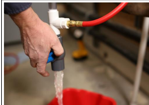
Figure 3: Drain water in Sight Tube